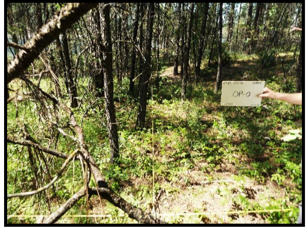
FFIPO1-56 0P-O, PRE Treatment (2016)