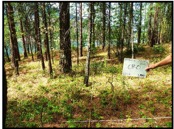
FFIPO1-56 0P-O, POST Treatment (2019)