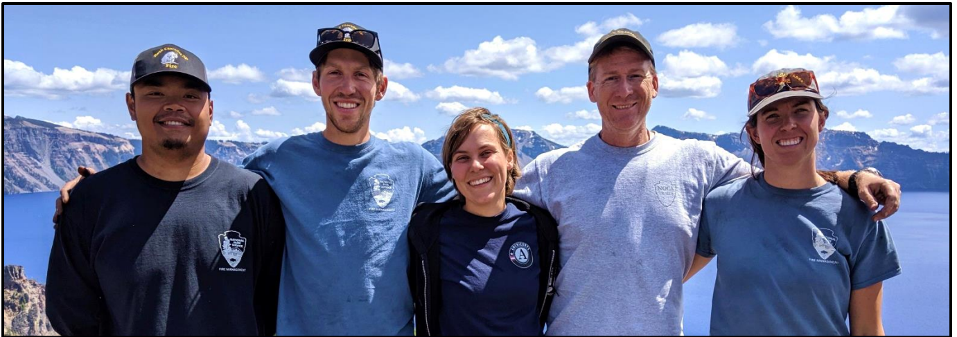
F2019 NPCB Fire Effects Monitoring Crew