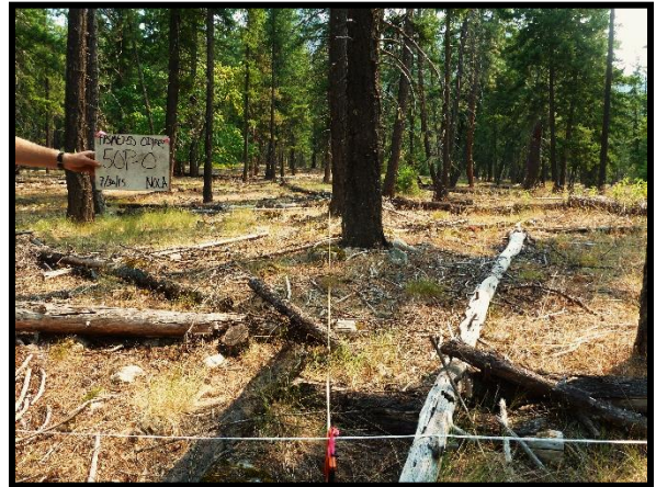
FPSME2-55 50P-O, PRE Treatment (2015)