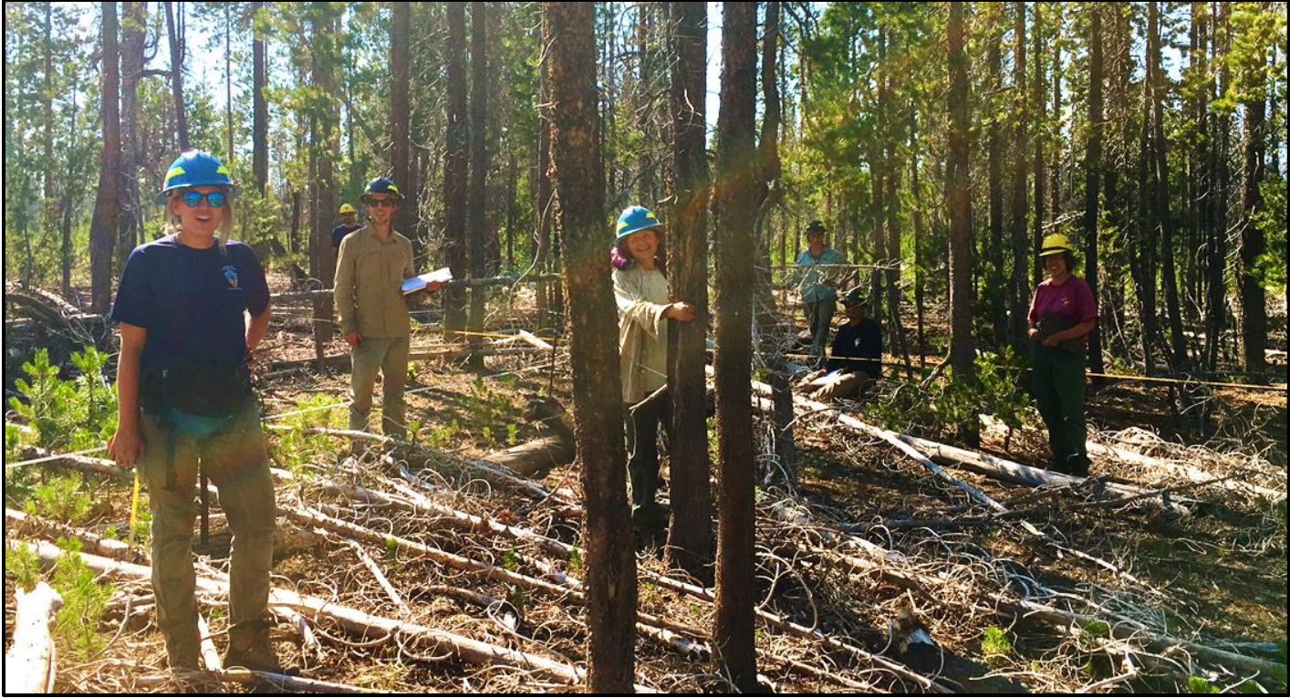
NPCB Fire Effects crew performing post-fire plot reads with KLAM Fire Effects crew at CRLA