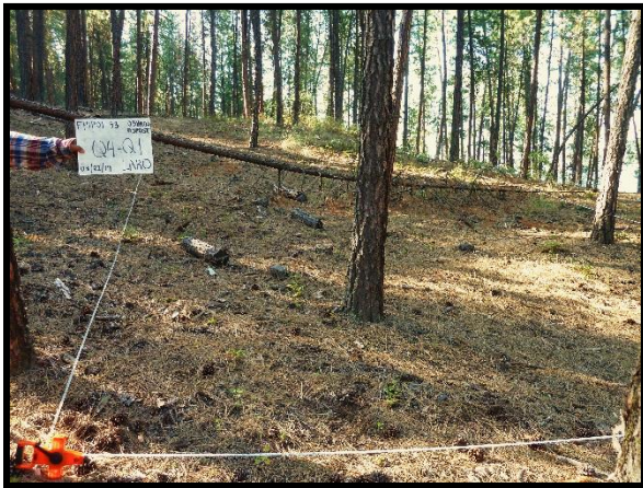
FFIPO1-53 Q4-Q1, POST Treatment (2019)