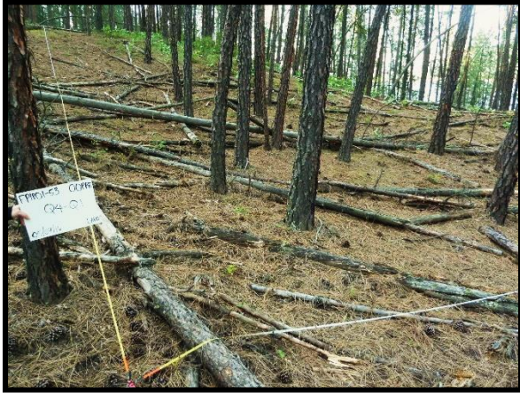
FFIPO1-53 Q4-Q1, PRE Treatment (2016)