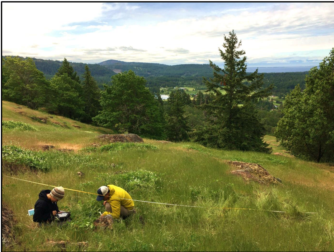
Conducting post-treatment read of SAJH Brome plot