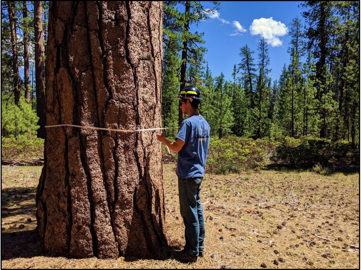
Measuring large diameter Ponderosa pine at CRLA