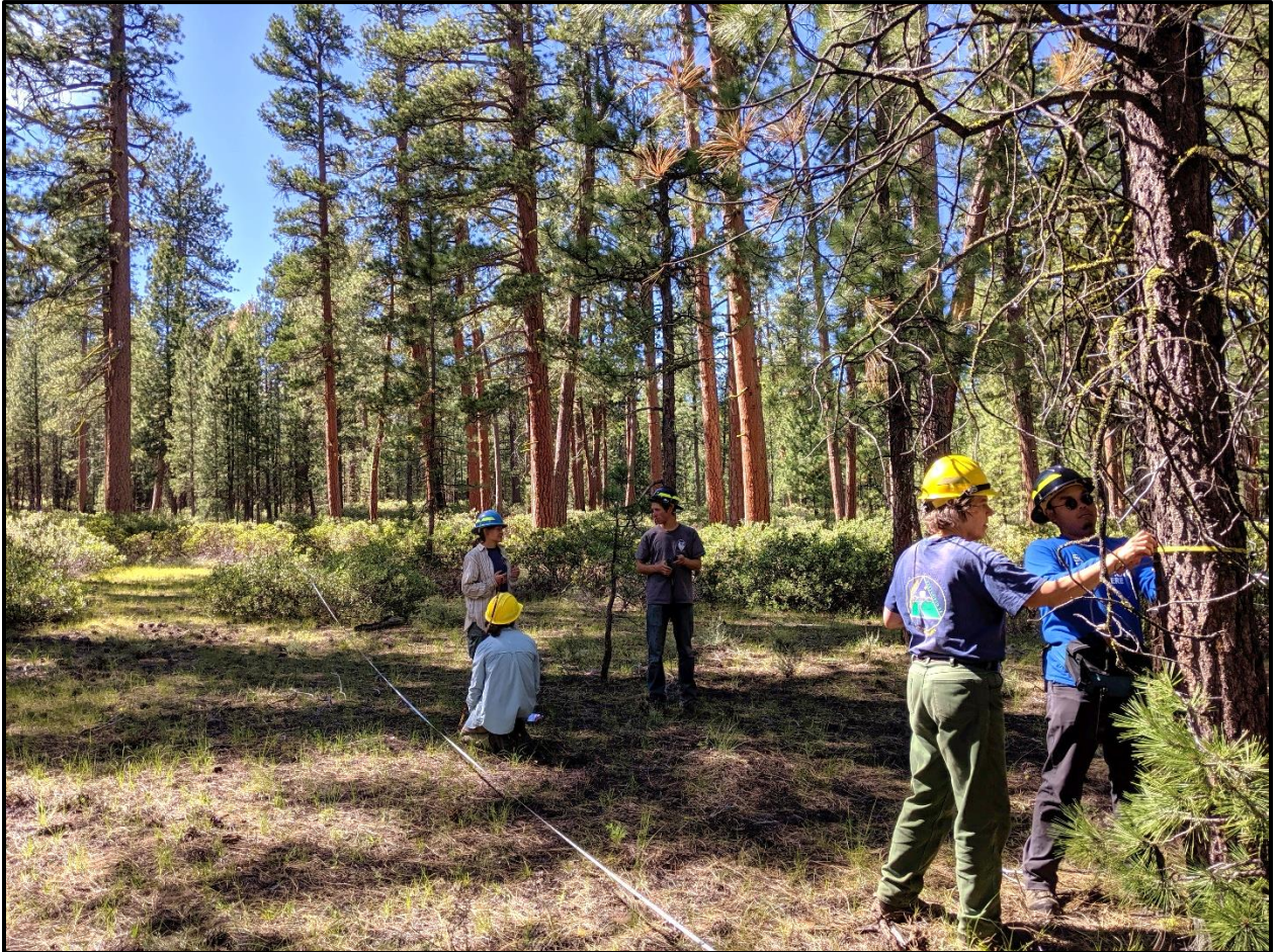
NPCB Fire Effects crew performing FMH plot reads with the KLAM Fire Effects Monitoring Crew at CRLA