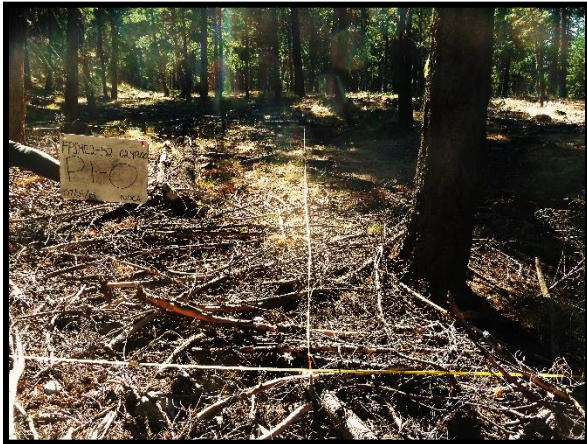
FPSME2-52 P1-O, PRE Treatment (2015)