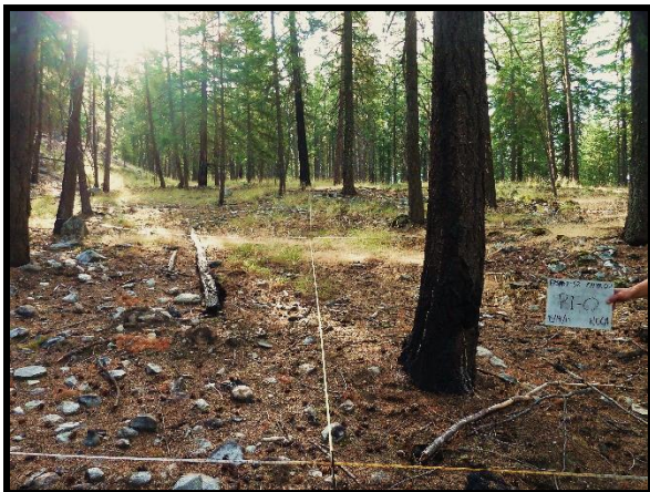
FPSME2-52 P1-O, POST Treatment (2019)