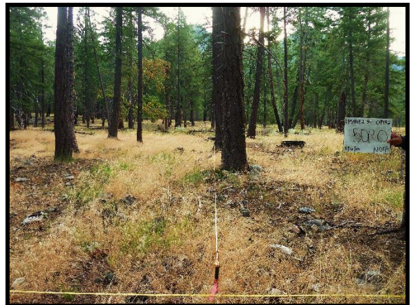
FPSME2-55 50P-O, POST Treatment (2019)